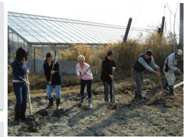
Internship I: Farming experience at Kabutoyama Farm