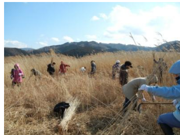
Fieldwork: Reed harvesting in Miyagi Prefecture