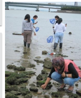
Internship II: Observation of aquatic organisms at Koshienhama Beach