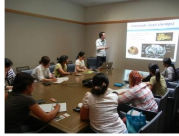
Environmental issues and ESD progress in Japan II: Lecture at Lake Biwa Museum, Shiga Prefecture