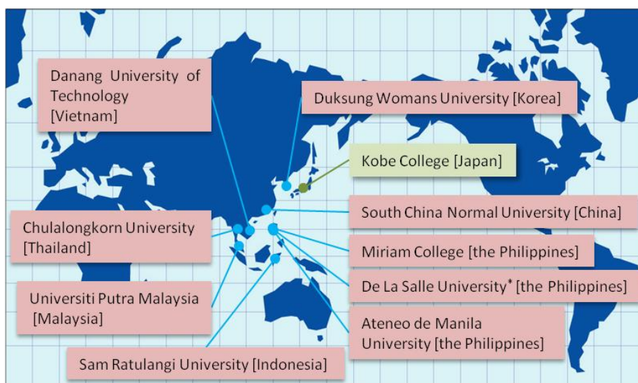
The location of Kobe College and home universities of international students.

In order to apply for the program, students must be female Master's students of a university that has exchanged a memorandum of understanding with Kobe College. Applicants should be studying ESD-related fields and must be recommended by the university at which they are currently enrolled. Recruiting and interviews take place in December through February. Acceptance is decided at the end of March.