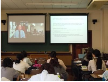
Environmental issues and ESD progress in Asia I: Lecture from Yuan Ze University (Taiwan) using the Internet video conferencing system