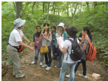
Fieldwork: Forest walk in Shirakami Mountain Range

Fieldwork is to be conducted as a few days' trip during spring break. Trainees will visit the other area than Nishinomiya City, which is the main field of this program. There, trainees will learn about the nature and culture of the local and actually experience on-site ESD projects. Also they will engage in discussions with volunteers and NPO staff members about ESD promotion based on local communities.